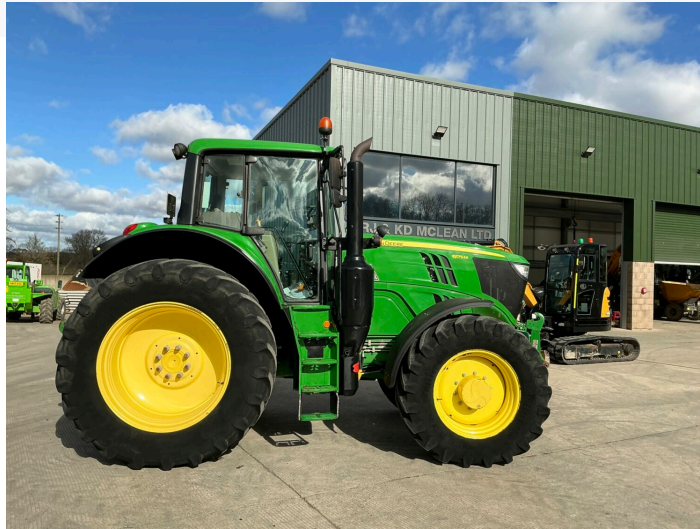
JOHN DEERE 6175M TRACTOR (ST22438)