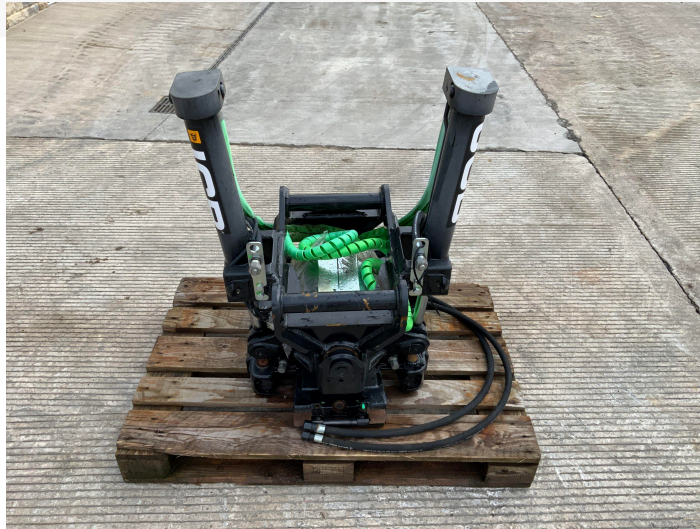
JCB/STEELWRIST X12 TILT ROTATOR HITCH (ST21087)