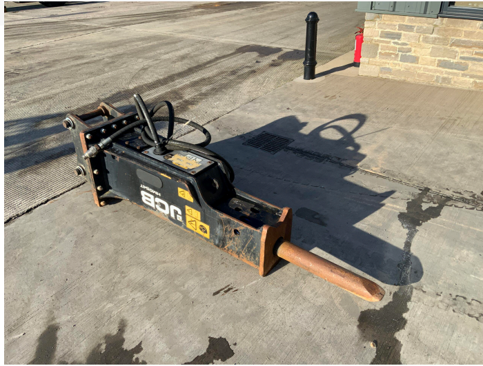
JCB HM54T BREAKER (ST21048)