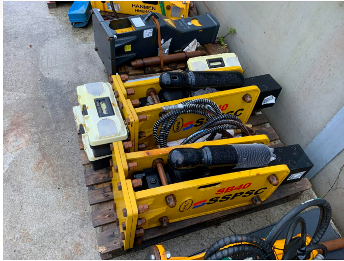
CHOICE OF 2 SSPSC SB40 BREAKERS (ST12174)